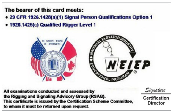
CSPR-1 Certification Card Back