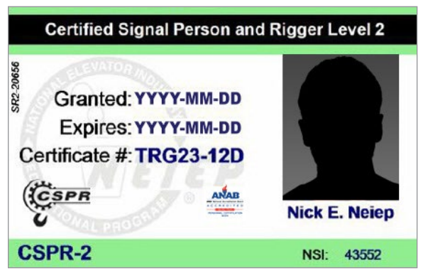
CSPR-2 Certification Card Front