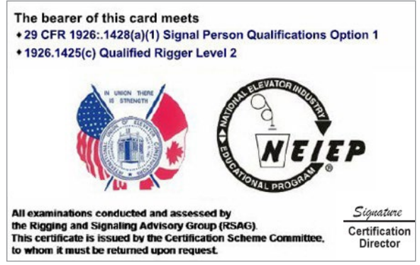
CSPR-2 Certification Card Back

This certification card remains the property of the Certification Scheme Committee, which may withdraw, cancel, revoke or otherwise annul the certification for cause.