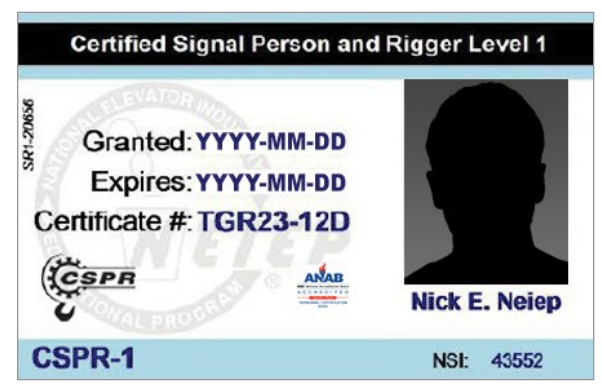
CSPR-1 Certification Card Front

Candidates who successfully complete the examination and whose credentials and application entitle them to certification will be notified by letter and awarded a Certified Signal Person & Rigger Level I and/or II (CSPR-1 or CSPR-2) card, a sample of which is displayed below.